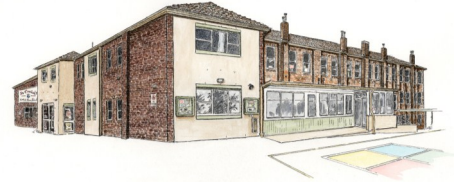
St Canice's Catholic Primary School Katoomba 2014