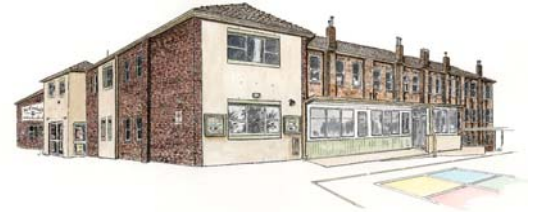
St Canice's Catholic Primary School Katoomba 2014