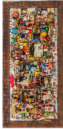
ROMY ROEDER Once Upon an Artistic 2015, found objects, 40 x 120 cm

The Regional Competition will offer cash prizes for the most inspiring artwork in each section, for an overall winner and for a people's choice award.