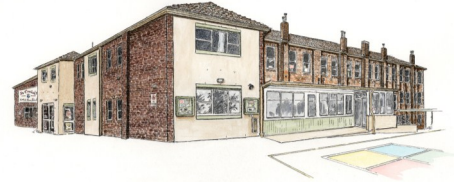
St Canice's Catholic Primary School Katoomba 2780