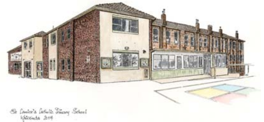
St Canice's Catholic Primary School Katoomba 2014

158 Katoomba Street (PO Box 200) Katoomba NSW 2780