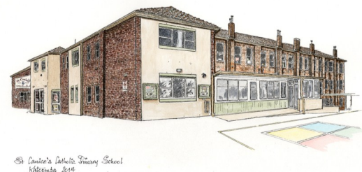
St Canice's Catholic Primary School Katoomba 2014

158 Katoomba Street (PO Box 200) Katoomba NSW 2780