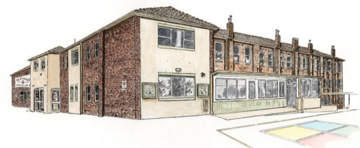
St Canice's Catholic Primary School Katoomba 2019